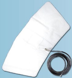
DVT CALF WRAP