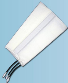
LARGE KNEE/FULL ARM