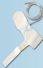
DVT FOOT WRAP