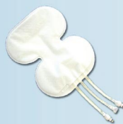
STANDARD SHOULDER/ HIP/KNEE